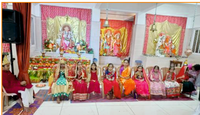
A view of Kanya Pooja