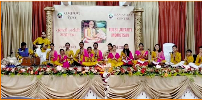
Recitation of Ramayana by students of RC