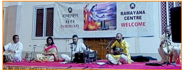
Bhajan by Swaranjali bhajan Mandali of Grand Bois