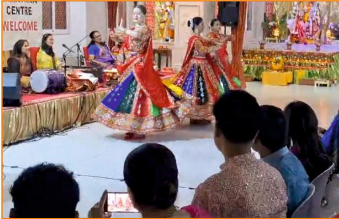
Dance by Anandam Group