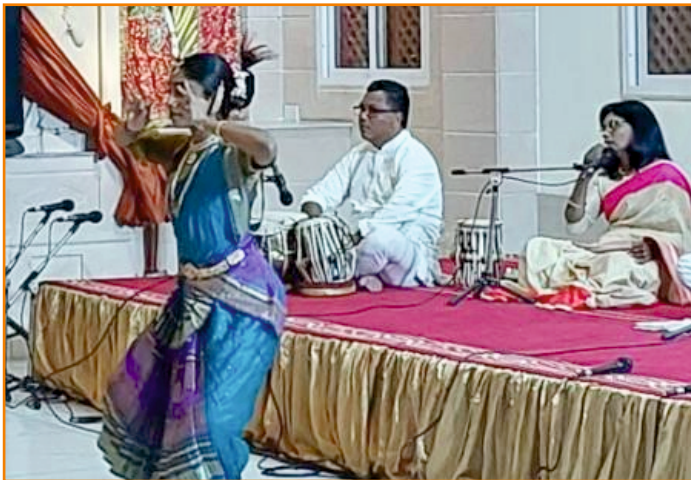
Dance performance by Gopeeka group

He stayed in Vrindavan for a period of 18 months and then moved to Mathura and killed Kansa, his own maternal uncle when he was only 10 years and six months old. He never returned to Vridavan again and established his kingdom in Dwarka nearly 1289 metres away from Mathoora. He had innumerable qualities, namely; compassion, patience, forgiveness, justice, impartiality, detachment, invincibility, generosity, beauty, dance, singing, honesty, truth, mastery of all arts, and control over mind and senses. We can learn about his life and contributions from Shrimad Bhagavatam and Mahabharat. His teachings are compiled in Shrimad Bhagavad Gita.