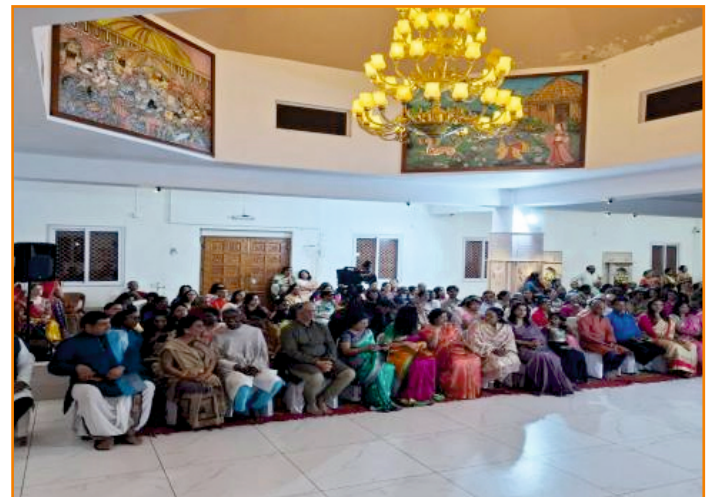
View of audience

This principle is applicable to all spheres of life, be it family, society, business, politics, diplomatic relations as well as international affairs.