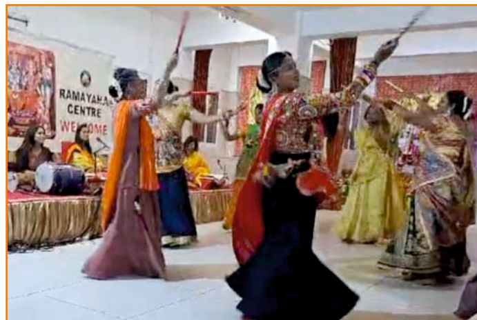
Garba Dance by a group of ladies of Keerthak School of music